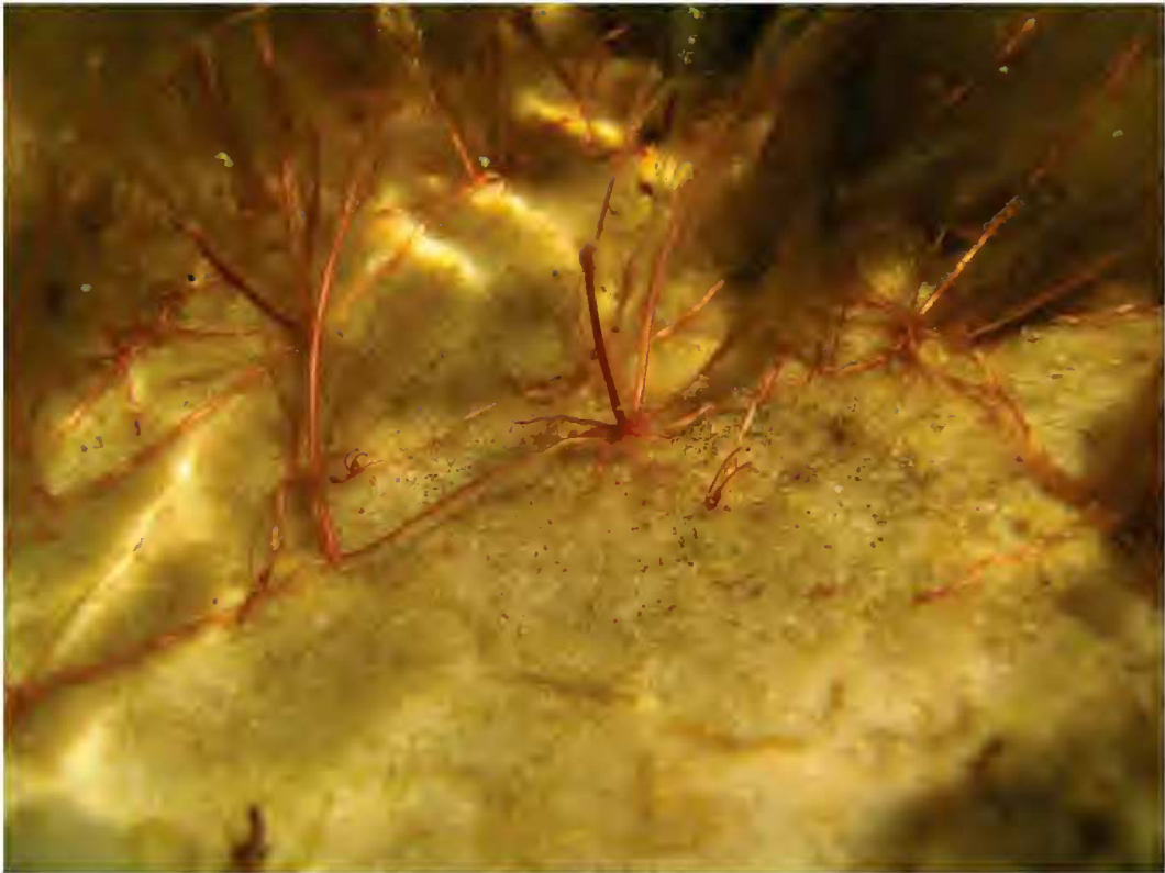
Figure 5: The claw-like rhizoids of U. neottiioides which anchor the plant firmly to the sandstone bedrock. Leaves and flower scapes are produced from the thick stolons.